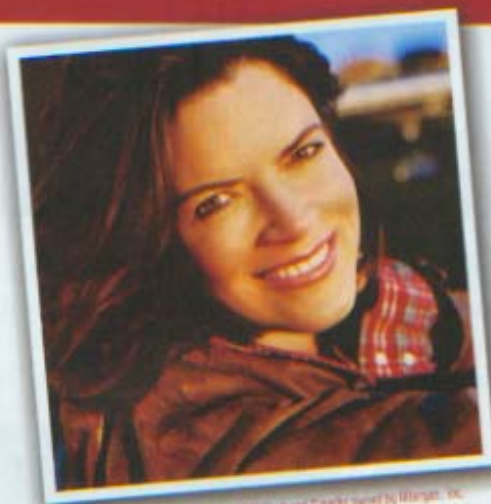
©2007 Allergan, Inc. Botox, BOTOX, and All ® marks used by Allergan, Inc.